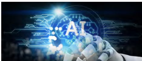
CYBERSECURITY FUTURES 2030: CLTC & WEF