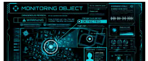
VON: EVOLUTION AFRICA