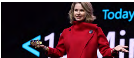
WOMEN IN TECH & CYBER