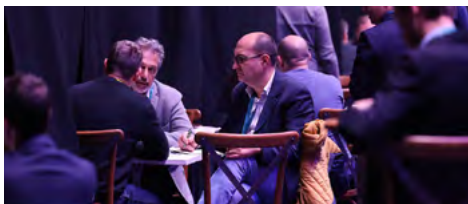
AFRICA CISO SUMMIT