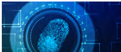
SPECIAL ROUNDTABLE DISCUSSION: SMART AFRICA