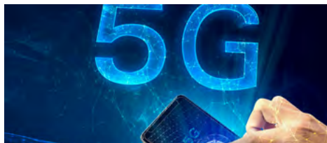
CYBER LANDSCAPE IN THE 5G AND IOT ERA